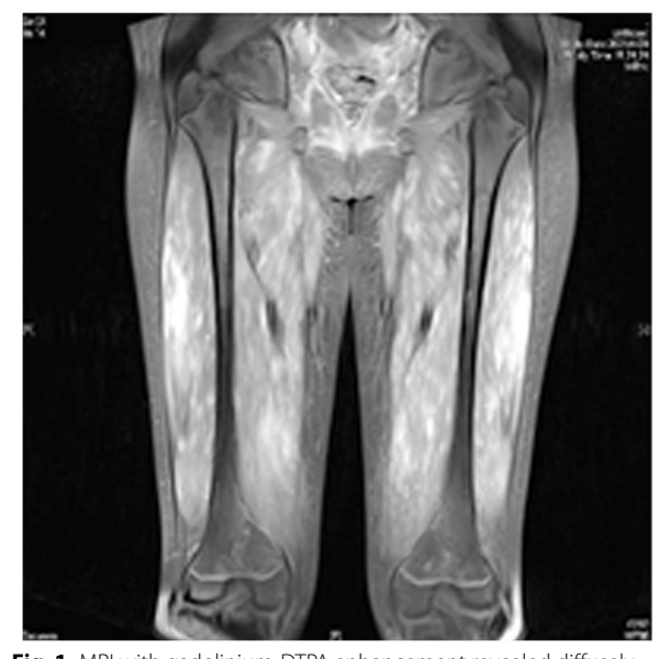
Fig. 1 MRI with gadolinium-DTPA enhancement revealed diffusely increased signal intensities in the myofascial planes of the bilateral iliopsoas, gluteus, obturator, pectineus, and hamstring muscles in the proton density image

Table 1 The results of blood chemistry, immunology, and serology tests at time of SLE and overlap syndrome being diagnosed